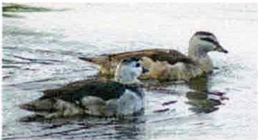
Cotton Pygmy Geese