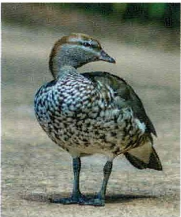
Australian Wood Duck