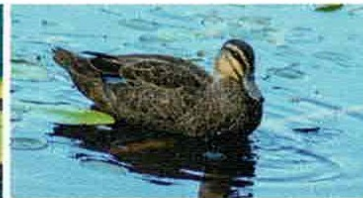
Pacific Black Duck