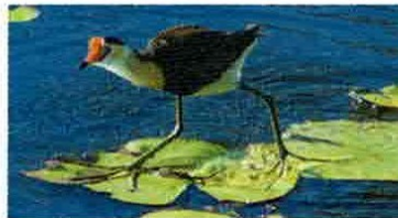
Comb- Crested Jacana