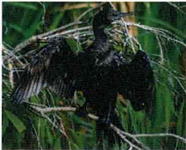
Little Black Cormorant